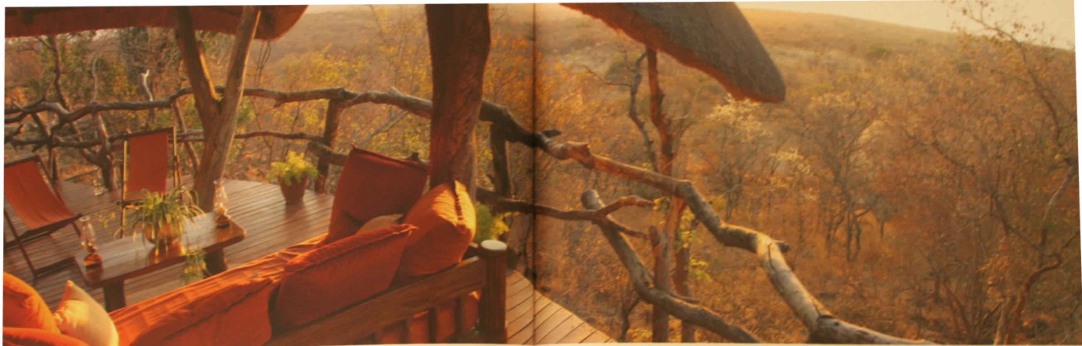
above Bird's-eye view

During the heat of the day, parents can relax by the pool while the children raid the toy box.